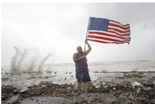
See the Recovery first-hand

Hurricane Ike ravaged the coast on the morning of Sept. 13, 2008,